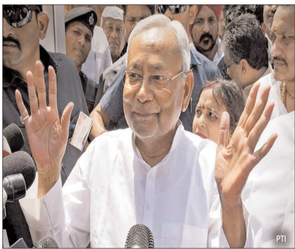
hary, state minister and JD(U) national general secretary, said.